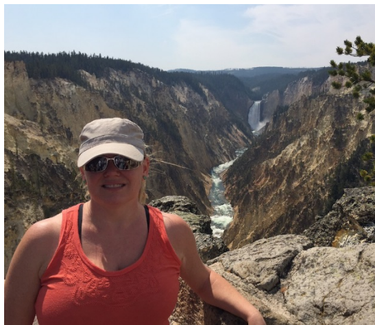
Photo from a 2015 trip to Yellowstone National Park

Discipline is another piece. It's easy to skip a workout in order to work but you need to realize that there will always be more work! You can skip several workout sessions but there will always be more to do, you'll never finish it all. Given that your work will never go away, accept it and go do something for you. Don't