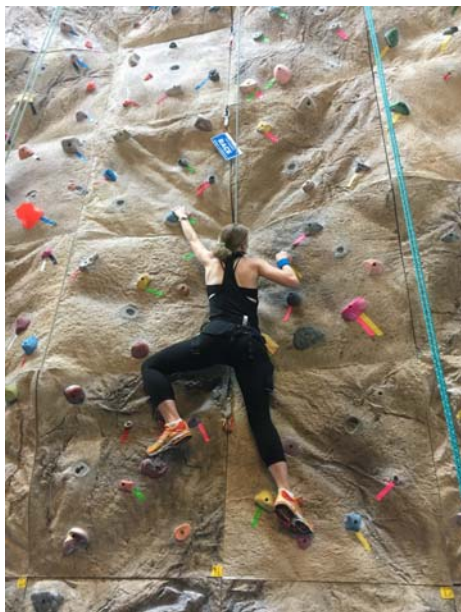
figure eight knot and climb up the wall to get their next clue. This challenge proved too easy and all the brawn participants were finished by 12:05 (the race ended at 12:30).

The brain challenge led the racers through a difficult scavenger hunt through the library. It was made even more difficult by a missing clue! Members of the Brawn challenge headed to the library to help their team crack the code.