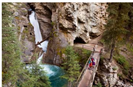
Johnson Lower Falls

Whatever your level, hiking is a great way to get moving this summer. It's a simple activity that doesn't require a lot of equipment. Of the essential items to bring, make sure you have: Lots of water, bear spray (even when staying close to the townsite), sunscreen, a jacket, and first aid kit. You can also take a snack and a map of the area. Most trail heads have maps that you can snap a photo of with your phone. Just be careful if it's a longer hike and your battery is low. Sometimes a paper map can be far more useful.