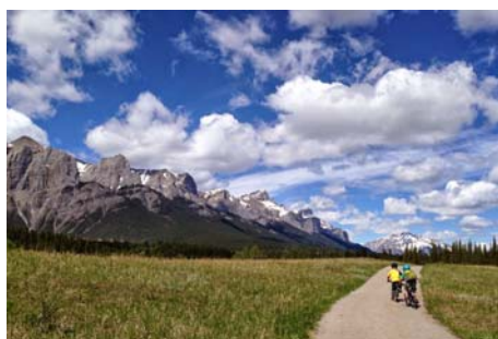
Three Sister Pathway

Similarly, the landmark Framingham Heart Study , the longest-running study of cardiovascular disease, found that women who went six years between vacations were eight times more likely to develop coronary heart disease or have a heart attack versus women who vacationed twice a year.