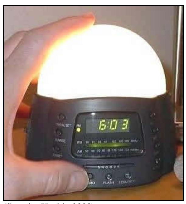
(Serenity Health, 2008).

This is a Blackberry, which is very popular among d/Deaf people. It equates to the use of a cell phone for non-deaf individuals.