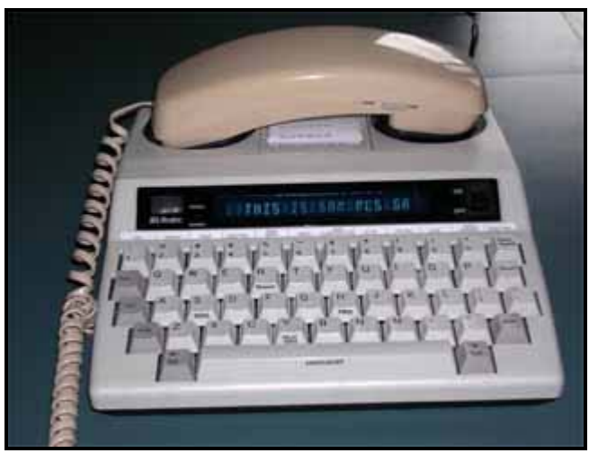
(E-Michigan Deaf and Hard of Hearing People, 2008).

This is a TTY which d/Deaf people commonly used before e-mail. A regular telephone would