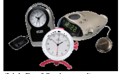
(Irish Deaf Society, n.d).

These are alarm clocks. The first picture has a light on top which will flash when the alarm goes off. The alarm clocks on the right have vibrators attached to them. The vibrators are placed under a d/Deaf person's pillow and will vibrate when the alarm goes off at the required time and wake the individual.