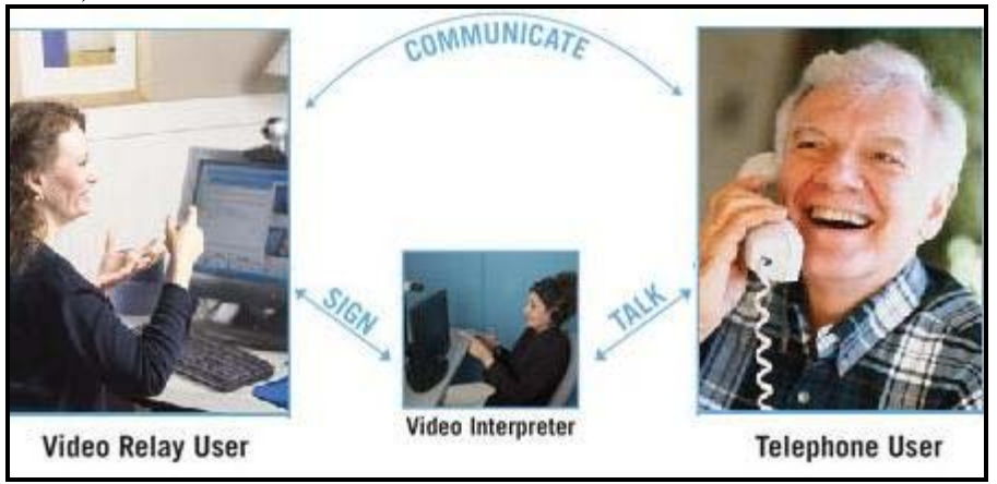
(Stone Deaf Pilots, 2007).

followed until the call is complete. There is a protocol and abbreviated language which is used on the TTY to save time. (This would be somewhat similar to the short cuts used in MSN).