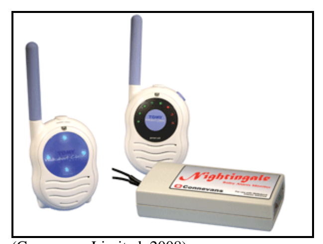
(Connevans Limited, 2008).

This is the newest technology sweeping through the Deaf community. It is called video relay services. Similar to the relay operator, webcams are used and d/Deaf people can now communicate using their natural language ASL as opposed to typing their message via the TTY. This process expedites communication and alleviates the frustration of worrying about whether the use of English is grammatically correct.