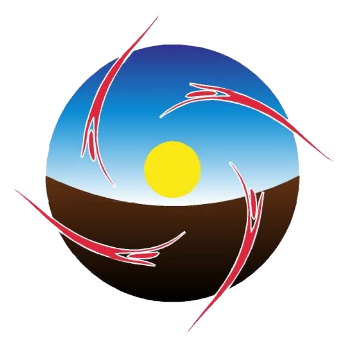
Pímatísíwin: A Journal of Aboriginal and Indigenous Community Health 5(2):151–174, 2008