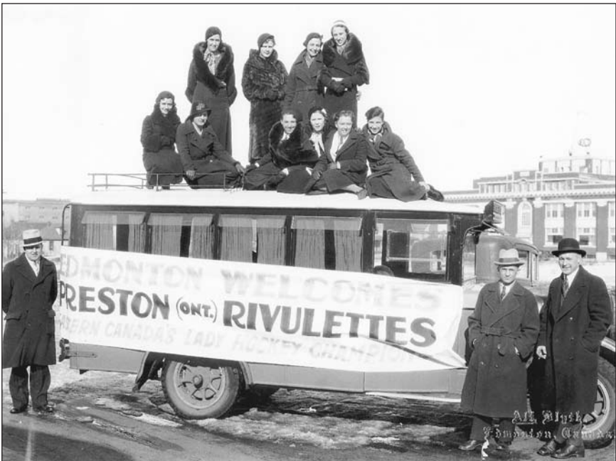
Figure 2 — The Preston Rivulettes in Edmonton, Ontario, Canada; March 1933.

In 1933, the Dominion Women's Amateur Hockey Association (DWAHA) was formed to establish regulations for a Dominion Championship series among the top women's teams from across the country. 43 For the first-ever women's hockey Dominion Championship, the Preston Rivulettes traveled to Edmonton to challenge the Western Champions. The Edmonton Rustlers covered all of Preston's expenses, making the Rivulettes's first out-of-province trip relatively inexpensive. With over 200 fans at the train station to see them off, the Rivulettes departed from Preston Wednesday evening and arrived in Edmonton Saturday afternoon—five