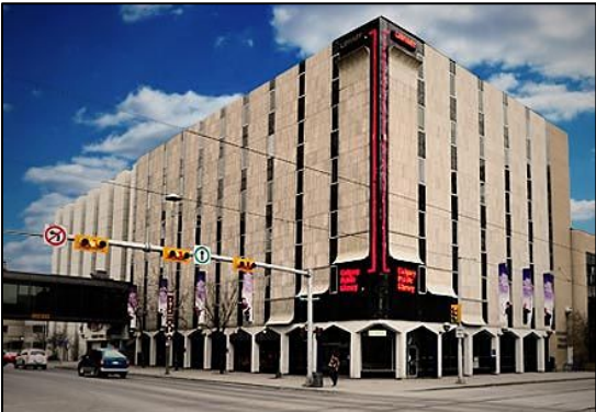
Current Central Library located downtown.

Suite S6032, 345 - 6th Avenue SE (6 th Floor, South Campus Building) Calgary, Alberta, T2G 4V1