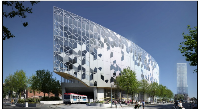
The new Central Library being built in East Village.