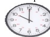
Create a Daily Study Schedule

Your second task in CAAP 6633 should be to review the appropriate Course Schedule and the Course Assignments Overview. Then create a study schedule incorporating a minimum of 3 hours of discussion forum activity a week and at least six hours of course reading and study task completion each week. Schedule in additional time for the completion of assignments.